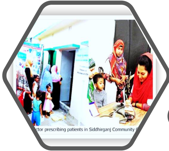
Doctor prescribing patients in Siddhirganj Community