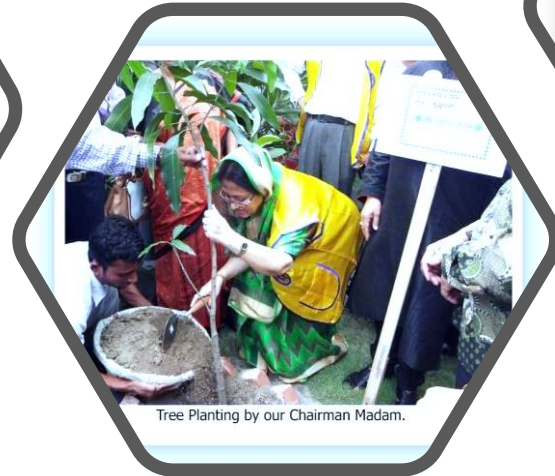
Tree Planting by our Chairman Madam.