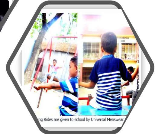
Swing Rides are given to school by Universal Menswear